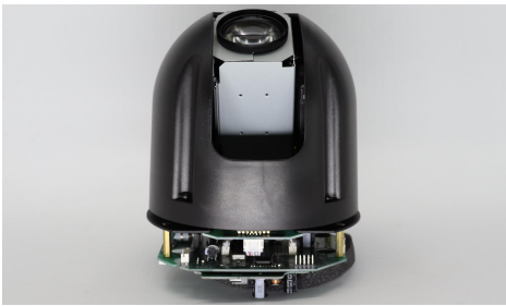
Camera PT Part